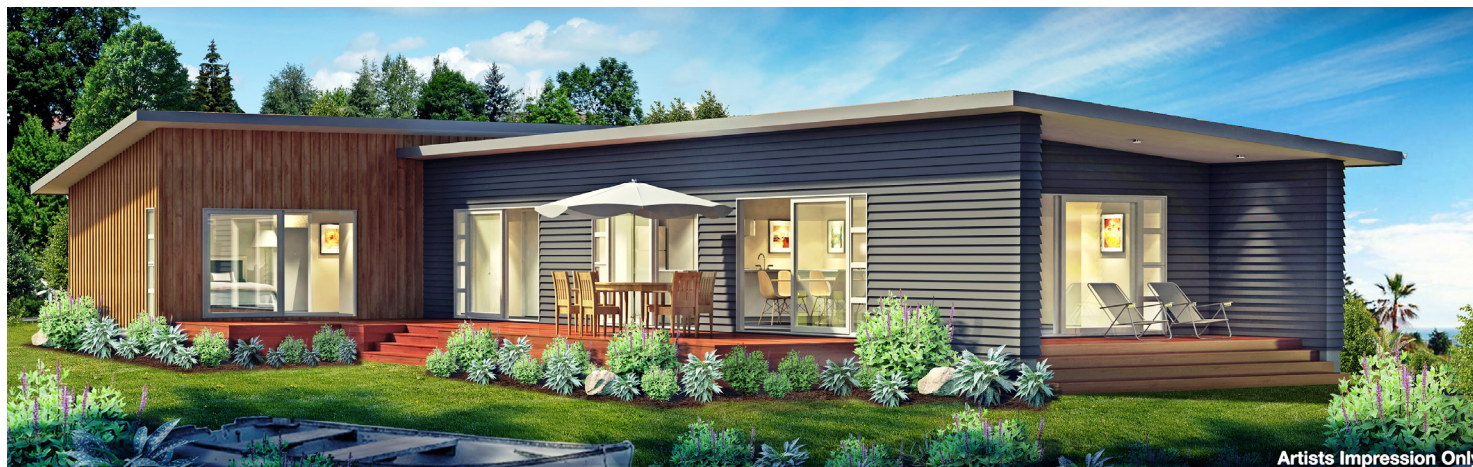
Artists Impression Only

Stylish, yet casual... that's Nikau. The design is perfect for outdoor living, with a double deck that allows a cosy retreat from the weather. The large and practical laundry/bathroom is ideal for a teenage family while an open plan kitchen draws the outside in.