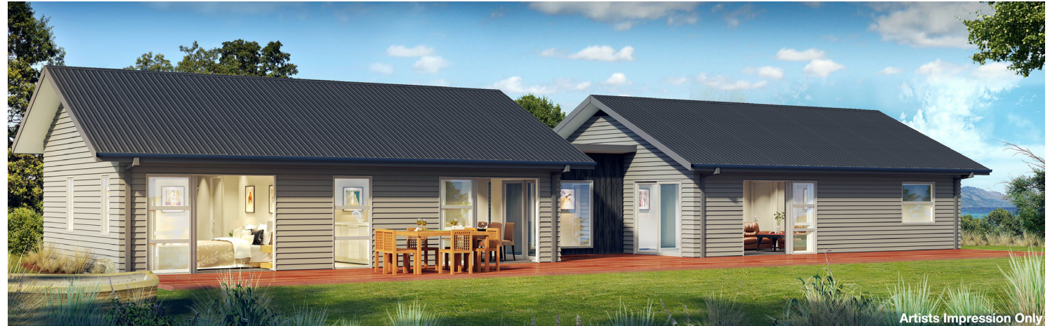
Artists Impression Only